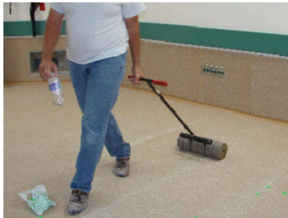
Use a 100 lb floor roller as soon as tile is set.