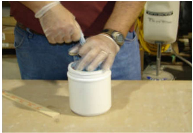
Mix resin and catalyst