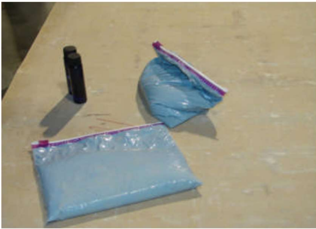
BONDED System resin and catalyst