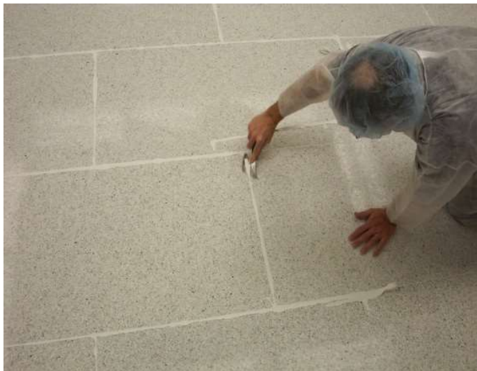
Remove excess BONDED