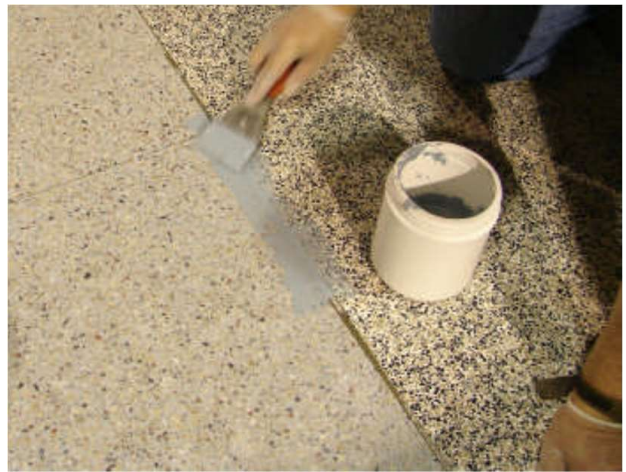
Apply BONDED to joints