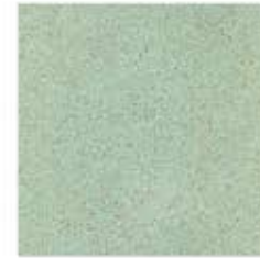
Spearmint Green 509-07