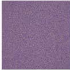
Plum Purple 509-14