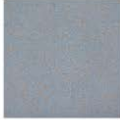
Azure Blue 509-13