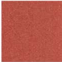
Brick Red 509-01