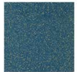
Ocean Blue 509-11