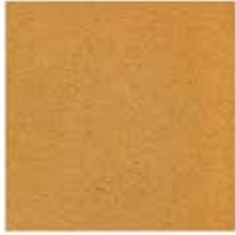
Amber Yellow 509-04