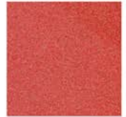
Summer Rose 509-02