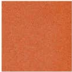
Orange Peel 509-03