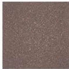
Chestnut Brown 509-15