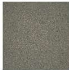
Crocodile Green 509-05