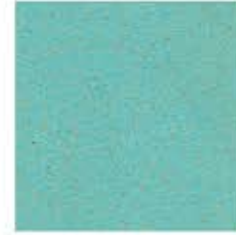
Blue Carribean 509-08