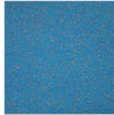
Sky Blue 509-10