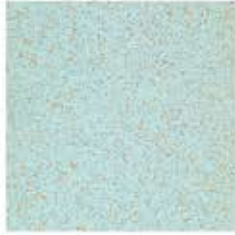
Arctic Blue 509-06