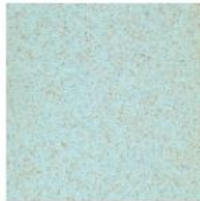
509-09 Arctic Blue