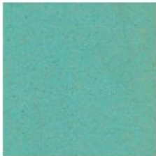
509-08 Blue Caribbean