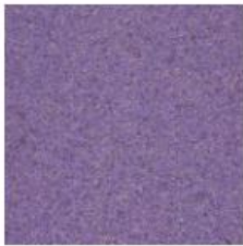
509-14 Plum Purple