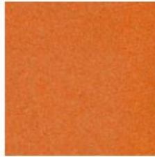
509-03 Orange Peel