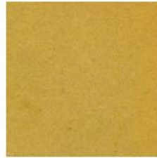
509-04 Amber Yellow