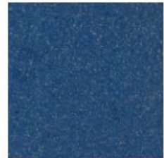
509-12 Blue Sapphire