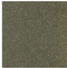
509-15 Chestnut Brown