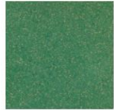
509-06 Emerald Green