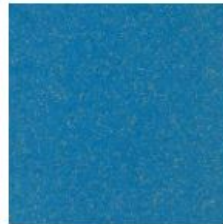
509-10 Sky Blue