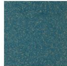
509-11 Ocean Blue