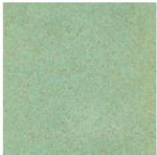
509-07 Spearmint Green