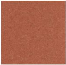
509-01 Brick Red