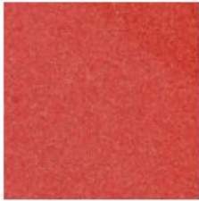
509-02 Summer Rose