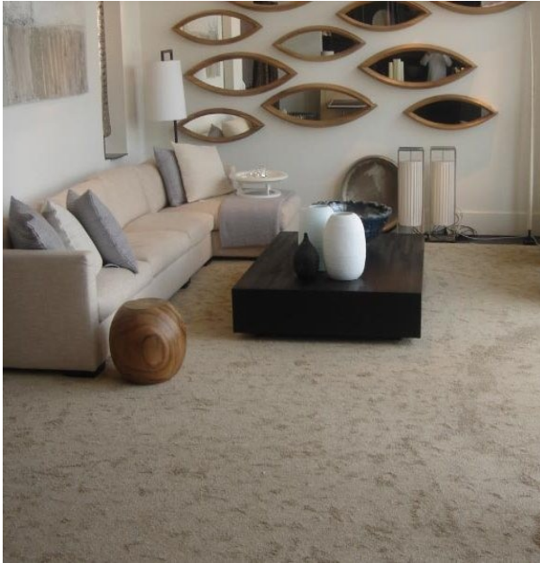
Style 3801 - 100% Cotton

Van Besouw Carpets showcase a European minimalistic style while providing the highest quality in performance. The bold color palette is purely European. Offered in eight high-end styles for your most discerning clients....