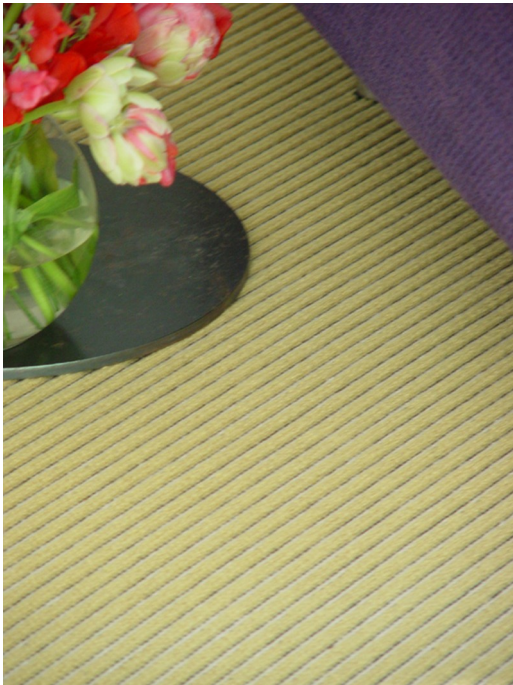
Style 1802 - 100% Wool

Imported from Holland, exclusively by Summit International Flooring...