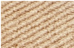
50% Wool / 50% Goats Hair - 4401